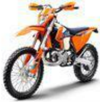
KTM 300 EXC TPI 2022