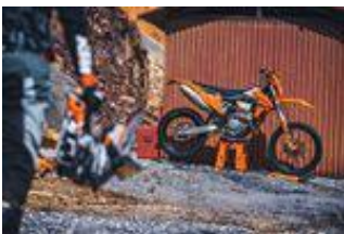
KTM 350 EXC-F 2022