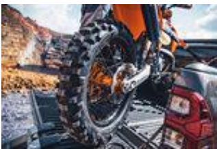
KTM 300 EXC TPI 2022