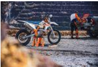
KTM 250 EXC TPI SIX DAYS 2022