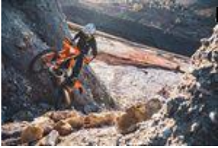
KTM 300 EXC TPI 2022