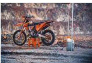
KTM 300 EXC TPI 2022