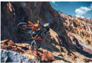
KTM 300 EXC TPI 2022