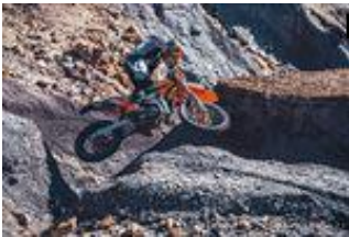
KTM 300 EXC TPI 2022