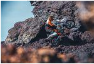
KTM 250 EXC TPI SIX DAYS 2022