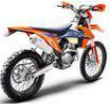
KTM 350 EXC-F 2022