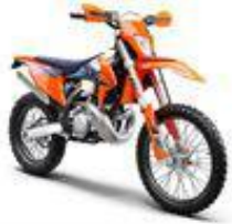
KTM 300 EXC TPI 2022