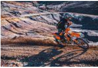
KTM 350 EXC-F 2022