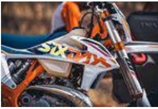
KTM 250 EXC TPI SIX DAYS 2022