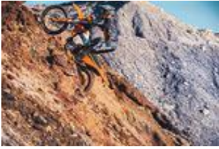
KTM 350 EXC-F 2022