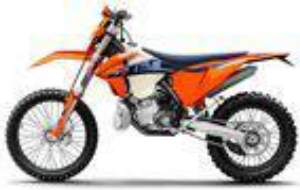
KTM 300 EXC TPI 2022